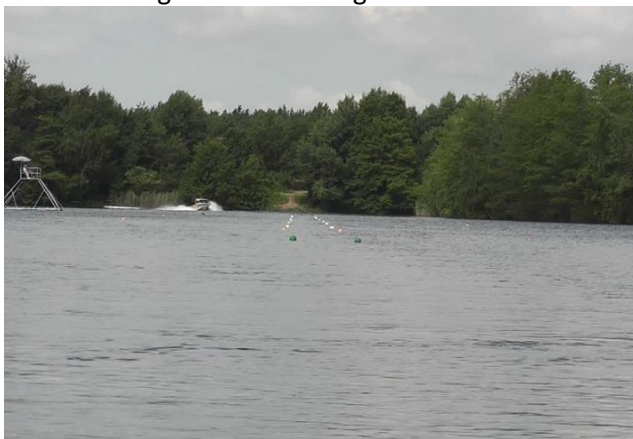
Not enough zoom