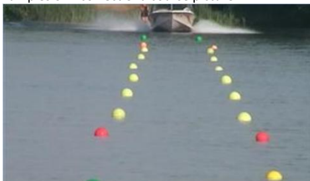
Edges of the monitor not visible