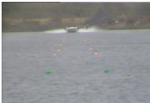
Not enough zoom and image too grainy