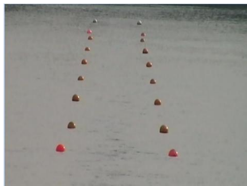
Edges of the monitor not visible camera to high