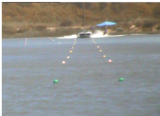
Not enough zoom and image too grainy