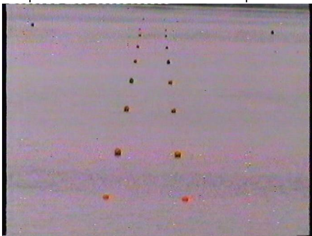
Camera too high and not enough zoom

Example of incorrect end course camera placement